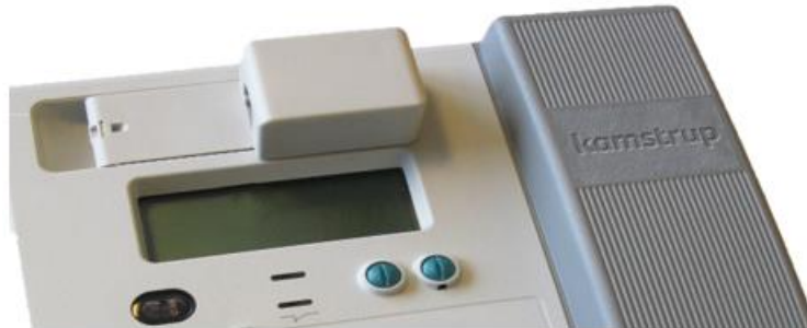
Figure 1. OMNIPOWER® meter with a HAN-NVE module

This interface specification describes the interface of the HAN-NVE module developed for OMNIPOWER® electricity meter used in OMNIA® Suite AMR systems.