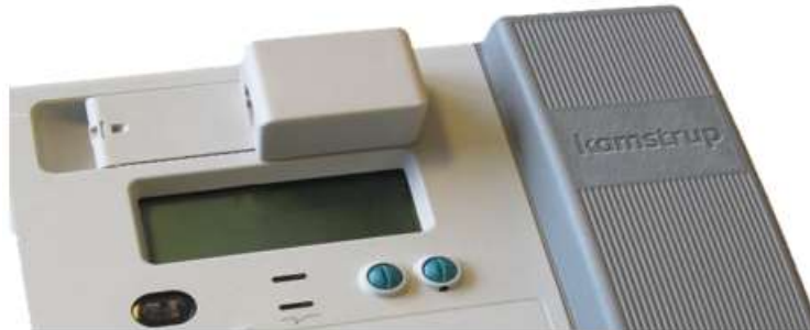
Figure 1. OMNIPower® meter with a HAN-NVE module

This interface specification describes the interface of the HAN-NVE module developed for OMNIPower® electricity meter used in OMNIA® Suite AMR systems.