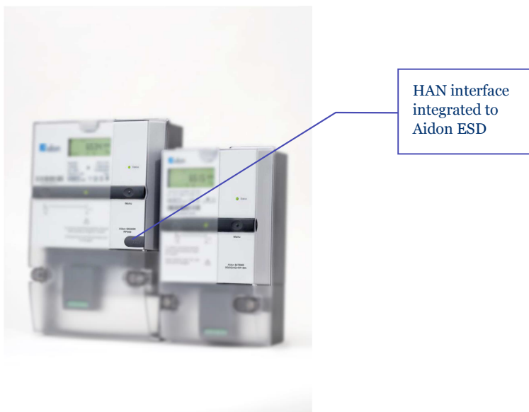
Figure 2: HAN interface integrated to ESD.

The picture below shows Energy service device where HAN is available on the front of cover.