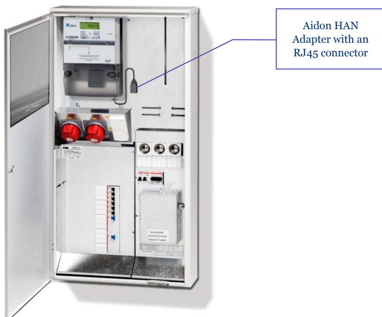
Figure 1: Example installation of the HAN adapter solution.

The picture below shows Energy service device where HAN is available on the front of cover.